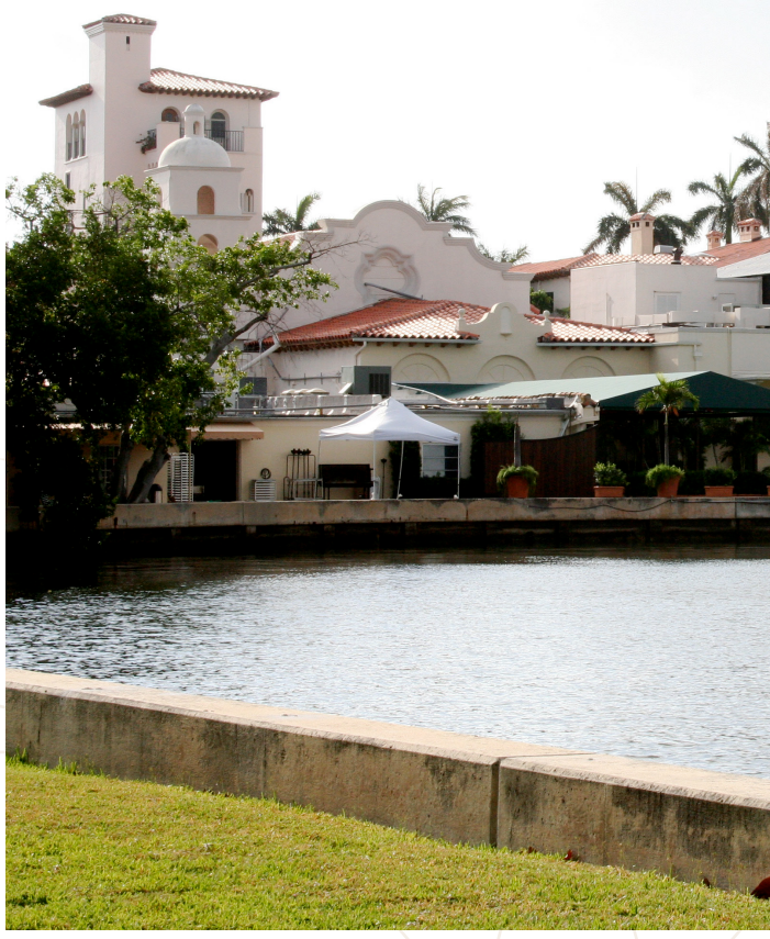
9 Golfview Road