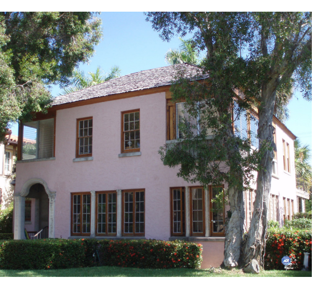
323 Chilean Avenue